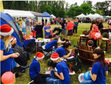
Leos working in the community

The revised date for the first meeting of the Wanaka Leo Club will be Wednesday 18 February, Room 20, 1.20 pm sharp.