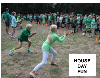
HOUSE DAY FUN