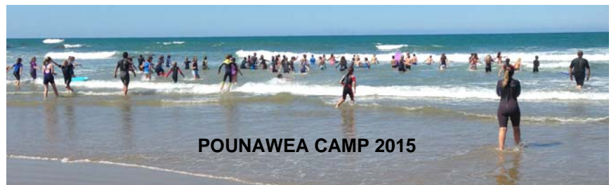
POUNAWEA CAMP 2015