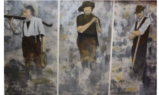
Some of the stunning student art work on display in the ECR on Tuesday.