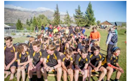
MAC ATHLETICS What a great day!