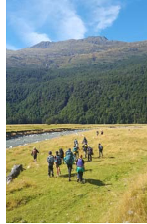
Action from Year 9 Camps More photos on page 4