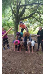
Year 9 Camp Photos